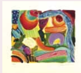
Gillian Ayres - Matuka

Spot signs of spring in our displays and create a spring collage. For 6 to 11 years.