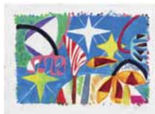
Gillian Ayres - Star Spangled , Print, 2010

Saturday 3 March, 11am - 3pm Join us in Freshford Memorial Hall for a variety of hands-on archaeology activities. Bring along your finds for identification too.